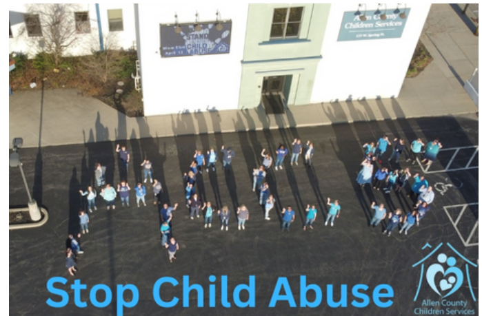
Allen County Children Services staff on Wear Blue Day 2023