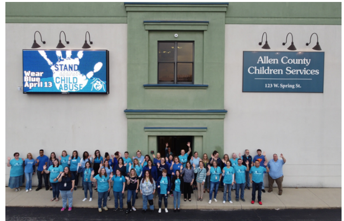
Allen County Children Services staff on Wear Blue Day 2022